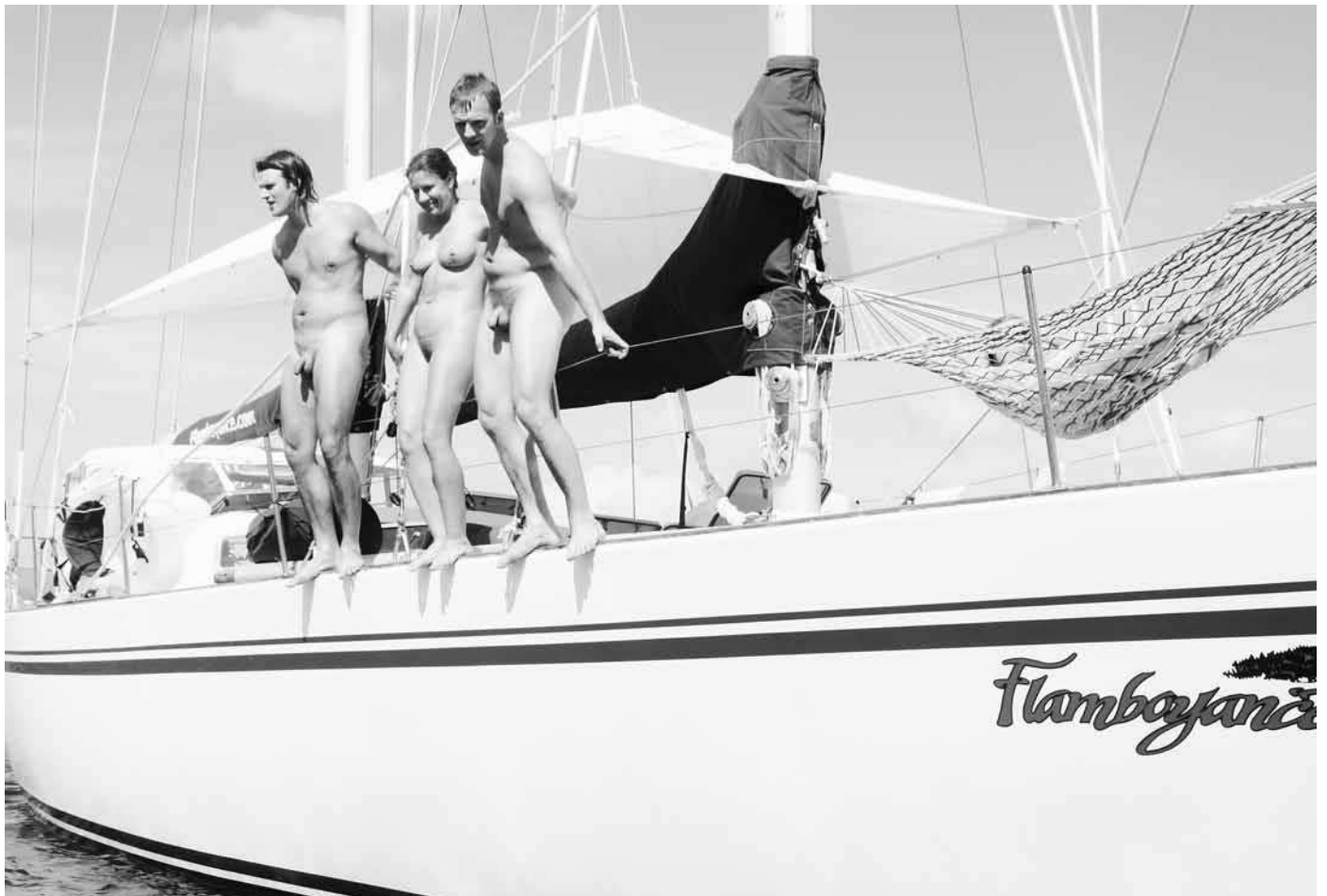
PREPARING FOR A MORNING SWIM at The Bight, Norman Island, in the British Virgin Islands.

“heads,” or washrooms, with toilet, sink and hand-held shower, plus a separate accommodation and head for the crew. There is also a showerhead on the back deck for rinsing off the salt after swimming, although fresh water is a precious commodity on a boat and must be used sparingly. A canopied cockpit for shade and cushions on the foredeck for sunning, and a hammock for use while moored, provided just enough comfort for this kind of holiday.