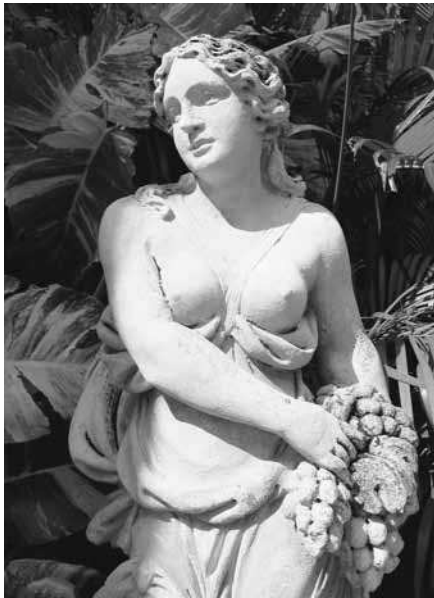
A STATUE in a courtyard outside a shop in Charlotte Amalie.

for the yachtie set. The place is notorious for its New Year's Eve bash which, I understood, hosts up to 2,000 people, some of whom arrive on those multi-million-dollar charter yachts mentioned earlier.