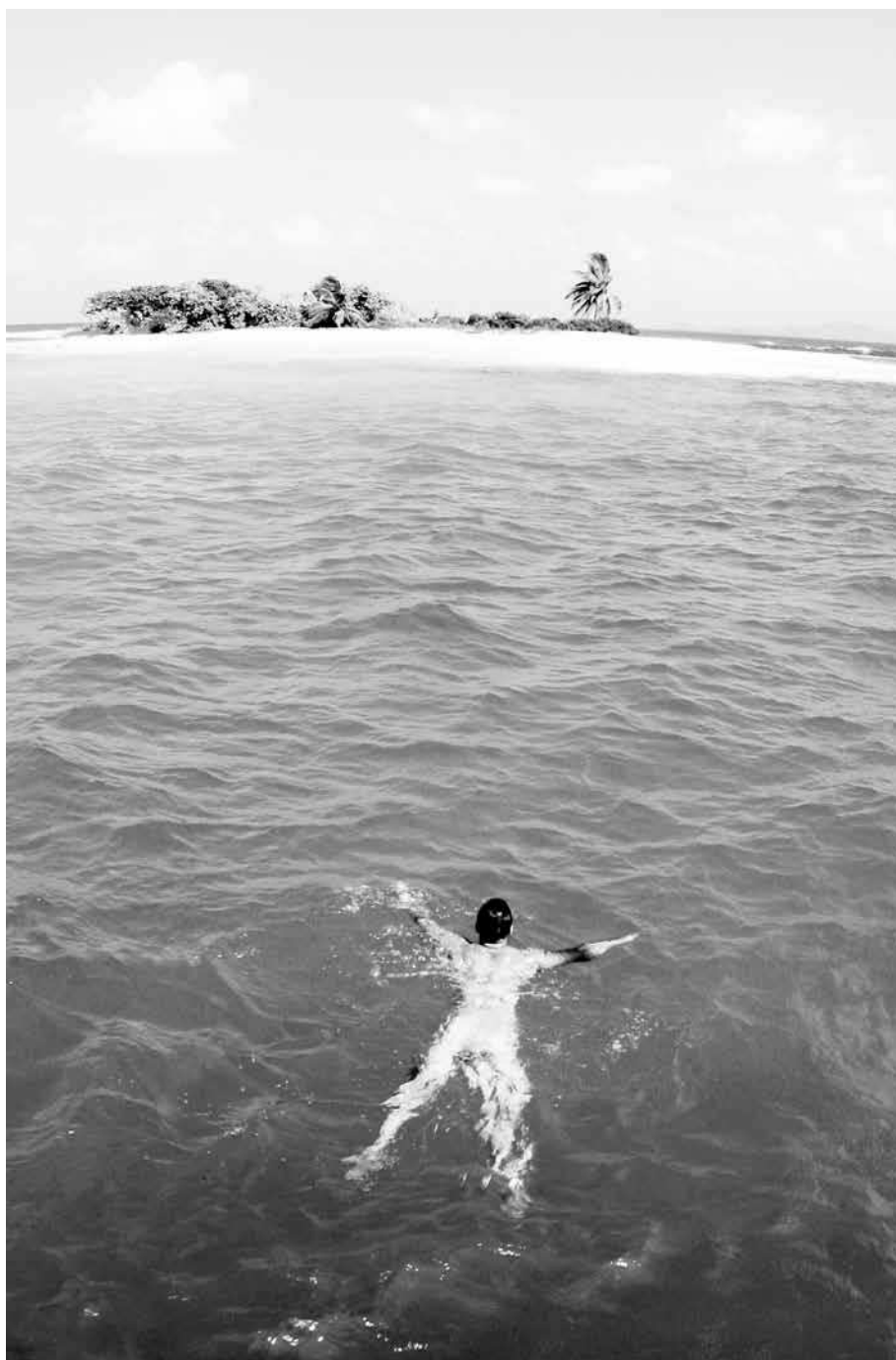
SWIMMING AT Sandy Spit near the east end of Jost van Dyck, also in the BVI.

For dinner we were treated to grilled mahi mahi with mango salsa, filet mignon, coconut shrimp with a vanilla champagne sauce, salmon, grilled chicken with angel hair pasta and tomato concassé (Cindy actually peeled, seeded and squeezed the tomatoes herself), and a pork tenderloin with a red wine reduction. Topped off with equally decadent desserts like chocolate mousse, cheesecake with port wine reduction, or rum-glazed bananas on angel food cake, it took all the swimming and snorkeling we