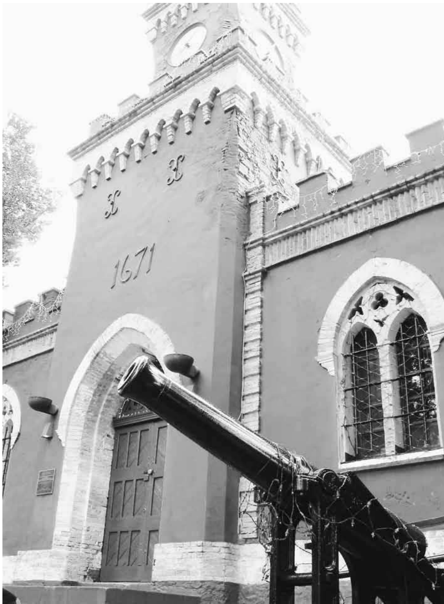
THE TOWN OF CHARLOTTE AMALIE, St. Thomas, offers many interesting sites for visitors, including Port Christian, the oldest standing structure in the Virgin Islands.

a while. I would still like to see the Baths on a calm sunny day...they truly are spectacular.